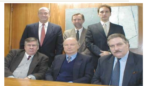
INVEST PARTNERS' TEAM

With central offices in São Paulo-SP and Rio de Janeiro -RJ, Invest Partners applies hands-on, regional coverage of Brazilian states and key South America countries which brings unique access to AAI. The group has managed financial advisory services for more than 50 companies in Brazil with significant experience in preparing firms for capital infusion, investment and opportunity analysis, creating and refining business plans and valuation services.